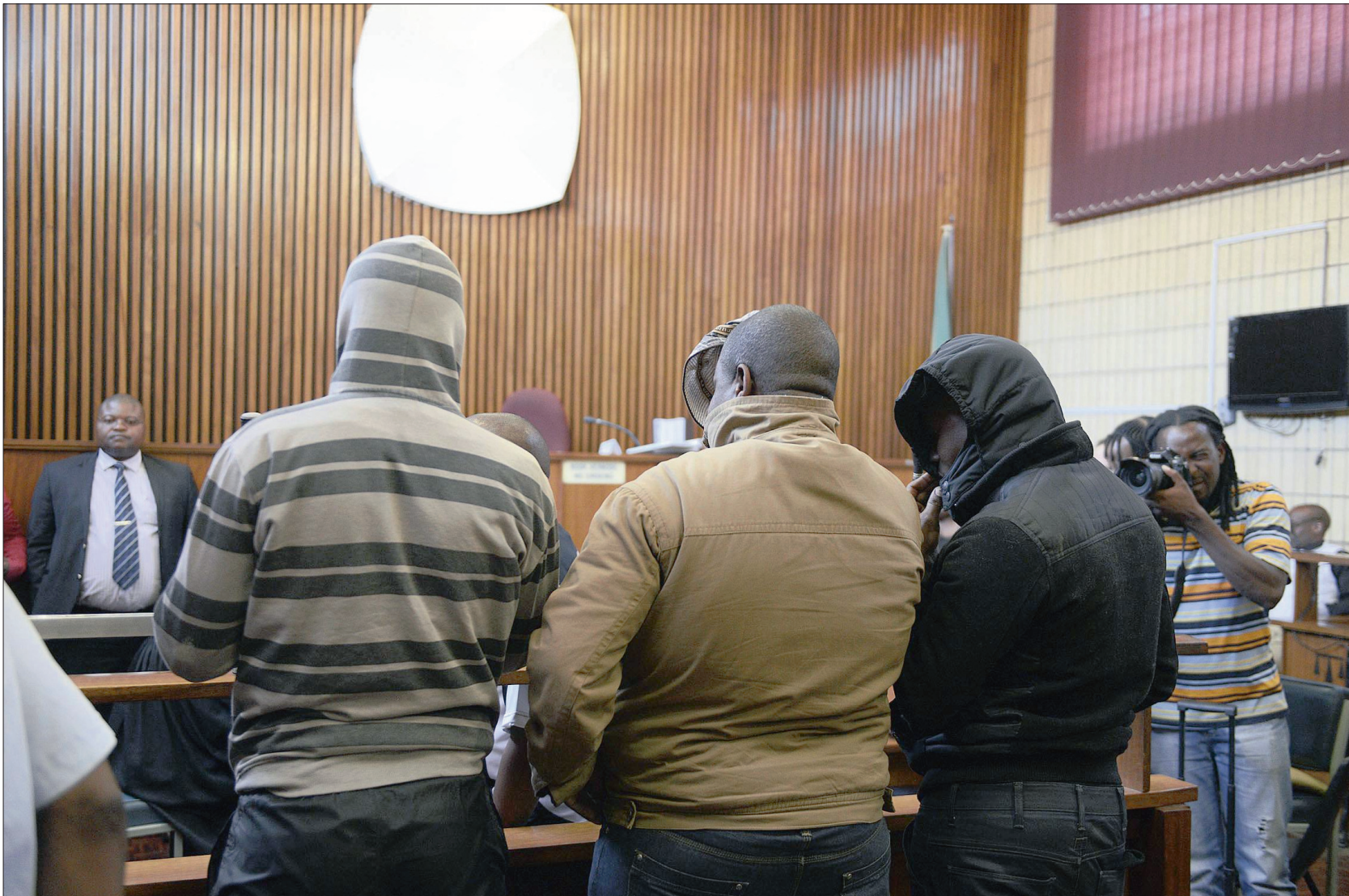
IN DOCK: Three of the four police officers who were arrested after allegedly shooting and killing a suspect appeared in the Krugersdorp Magistrate’s Court yesterday.