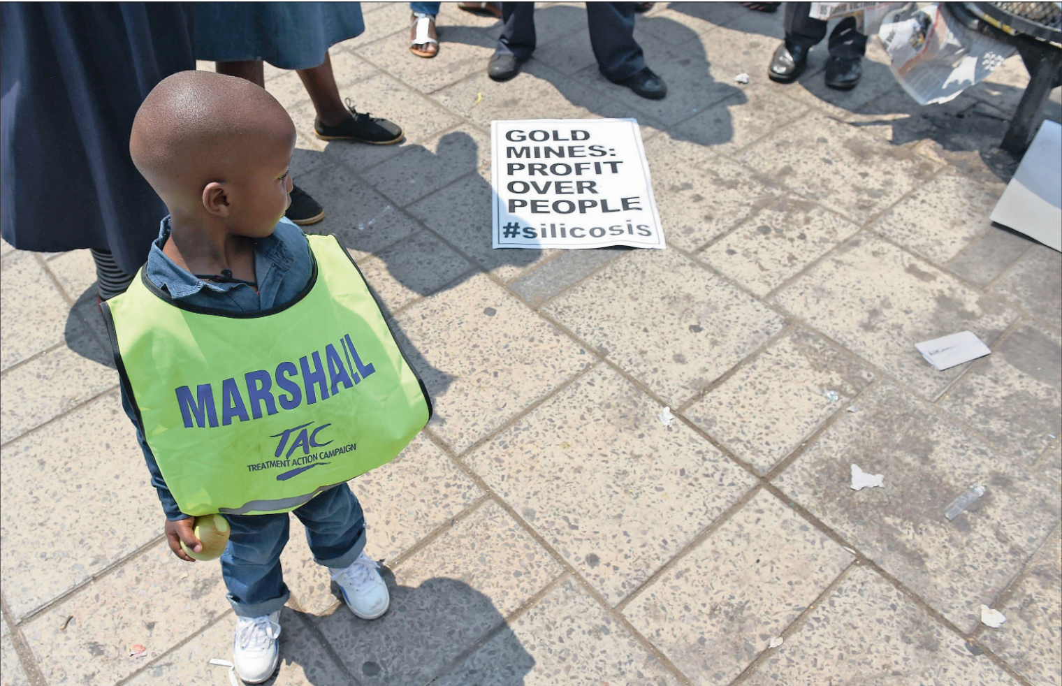
PROTESTING: A boy joins the Treatment Action Campaign and Sonke Gender Justice demonstration outside the high court in Joburg yesterday, to raise awareness for mineworkers with silicosis or tuberculosis on SA’s mines.

The matter is expected back in court on Monday.