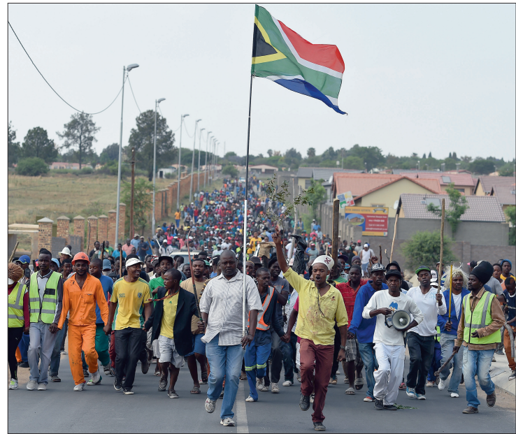
AGGRIEVED: Kya Sand informal settlers blocked roads and disrupted traffic in Malibongwe Drive yesterday.