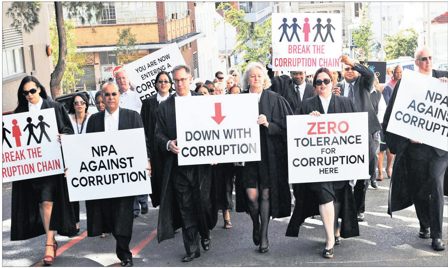
The National Prosecuting Authority in Cape Town came out in force to commemorate International Anti-Corruption Day yesterday, with a march by prosecutors and NPA staff members outside their building in the Mother City.