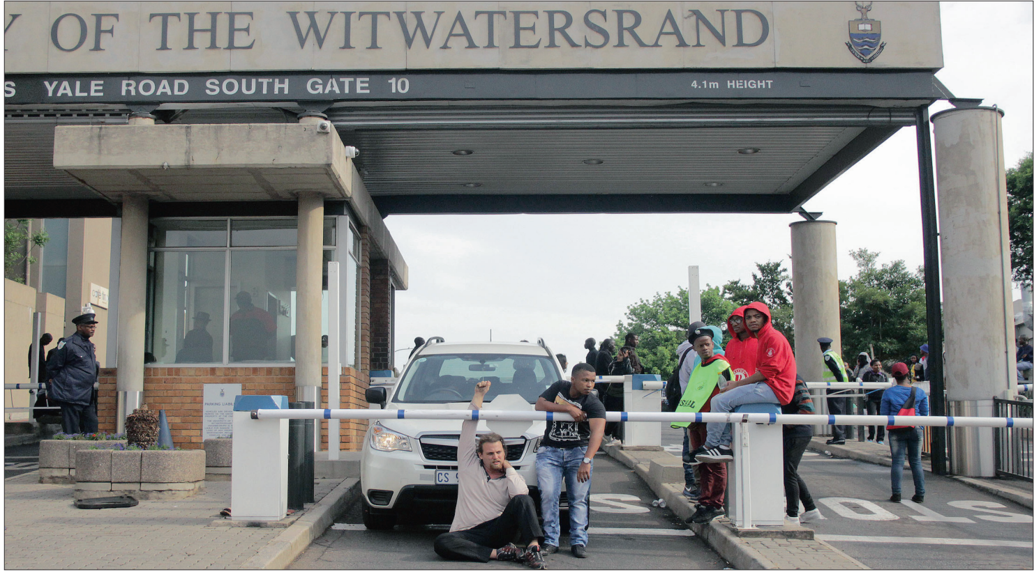
NO GO: This white subaru was stopped by protesters as it was leaving the university this morning. They blocked it for about an hour before the police convinced the protesters to move back, according to the driver.