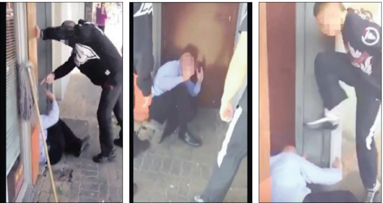
RETLIATING: A man cowers in fear as he is beaten for allegedly raping his attacker's daughter.