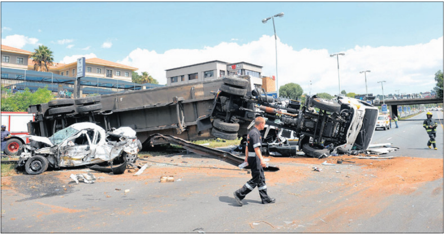
TRAGEDY: A taxi driver died after a truck lost control on the M1 in Joburg between 11th Avenue and Glenhove, with 24 people injured.

The strikers had toyi-toyed loudly before his arrival.