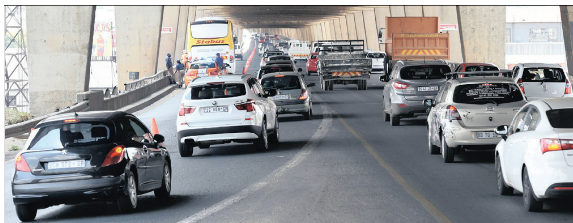
OMINOUS: Traffic quickly became heavily backed up yesterday during a temporary road closure at the Booyens exchange leading along and towards the M1 double-decker section.